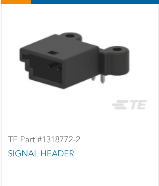
TE Part #1318772-2 SIGNAL HEADER