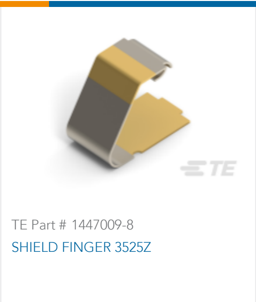
TE Part # 1447009-8 SHIELD FINGER 3525Z