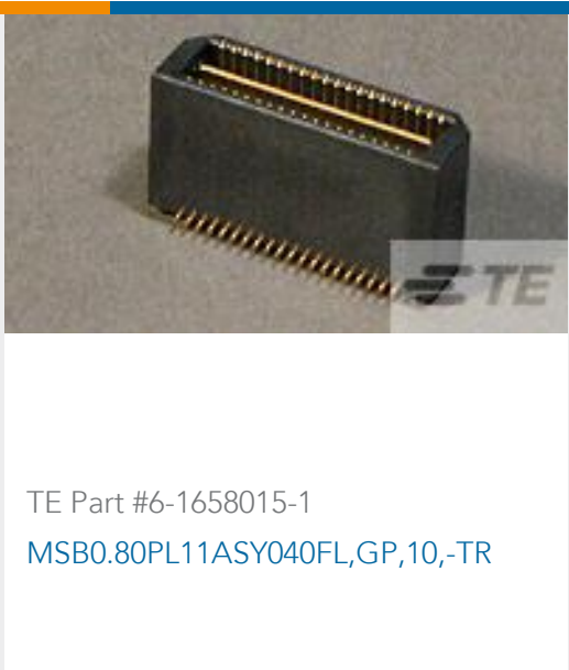
TE Part #6-1658015-1 MSB0.80PL11ASY040FL,GP,10,-TR