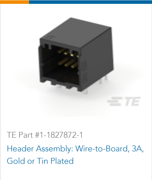
TE Part #1-1827872-1 Header Assembly: Wire-to-Board, 3A, Gold or Tin Plated