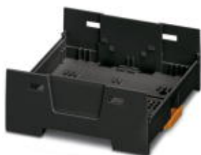
Component housing, Lower part, color: black, width: 70 mm

Please be informed that the data shown in this PDF Document is generated from our Online Catalog. Please find the complete data in the user's documentation. Our General Terms of Use for Downloads are valid ( http://phoenixcontact.com/download )