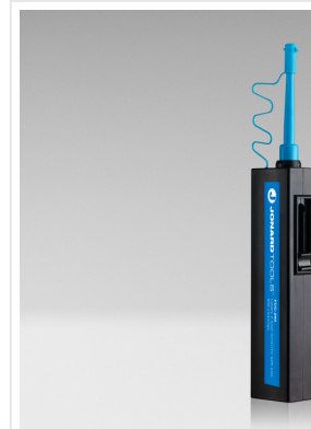
FCC-250 - Fiber Connector